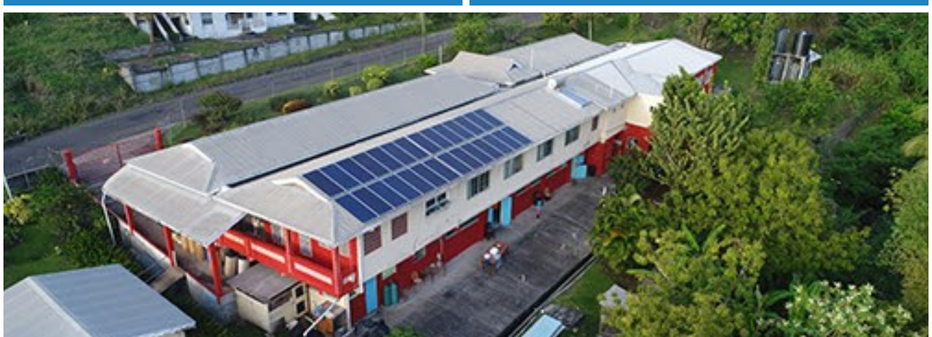
Dorothy Hopkin Home for the Disabled