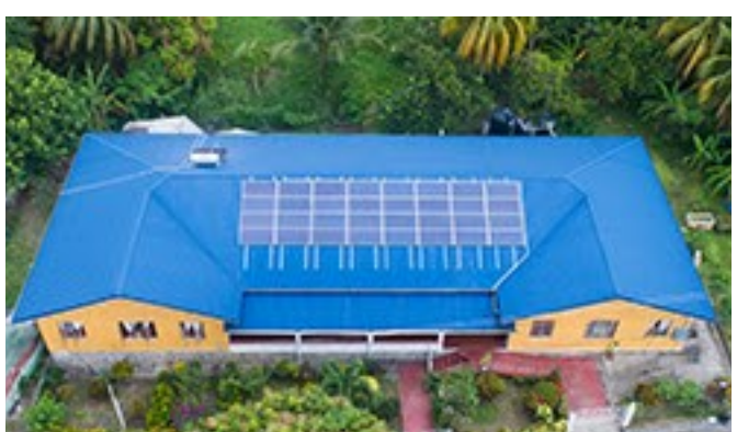
Charles Memorial Home